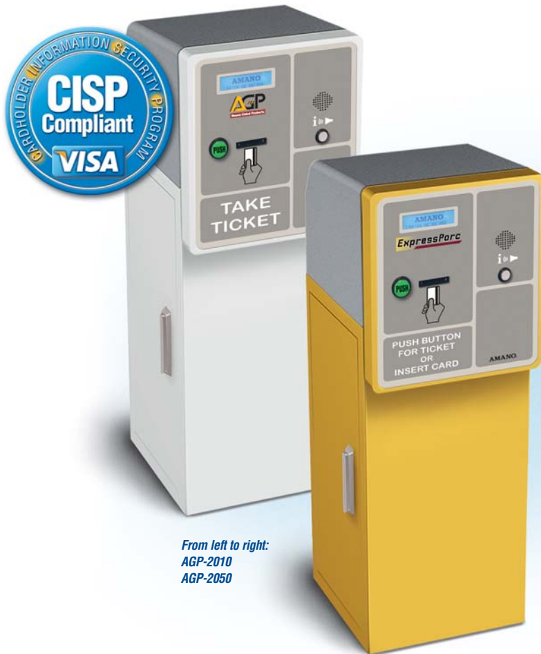
From left to right: AGP-2010 AGP-2050

The AGP-2000 Series Entry Station is designed for multiple uses, typically at the unattended entrances of a parking facility. The AGP-2010 Series Entry Station dispenses a mag-stripe parking ticket. The AGP-2050 Series Entry Station adds access cards and credit card functionality such as ticket in/credit card out, and credit card in/credit card out when used with an AGP-6050 Series Exit Station.